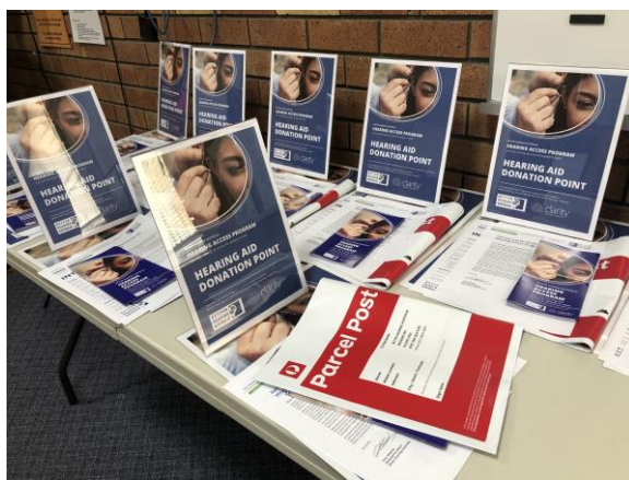
Hearing Aid Donation Point Kits ready for assembly by our volunteers prior to distribution to our community partners

BHA Brisbane continues its partnership with Queensland-owned audiologists Clarity Hearing and Balance to deliver the BHA Hearing Access Program (HAP).